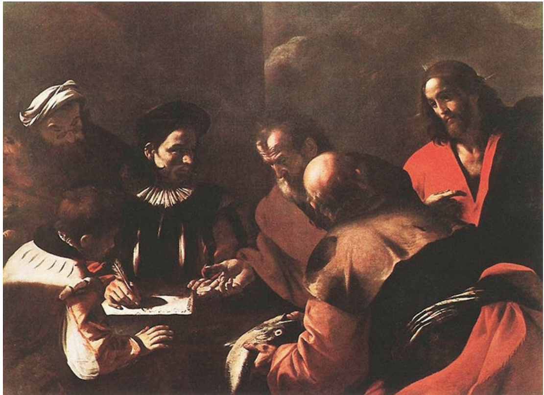
A Fish Pays the Tribute Money - Mattia Preti 1640

children, or from strangers?” Peter said to him, “From strangers.” Jesus said to him, “Then are the children free. Notwithstanding, lest we should offend them, go to the sea, and cast a hook, and take the fish that first comes up: and when you have opened his mouth, you will find a piece of money: take that, and give to them for me and you.” 1 Mt17:24-27