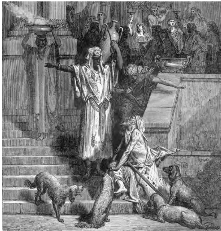
Lazarus Begging at the Rich Man's Gate - Gustave Doré

T here 3 was a certain rich man, which was clothed in purple and fine linen, and fared sumptuously every day: And there was a certain beggar named Lazarus, which was laid at his gate, full of sores, And desiring to be fed with the crumbs which fell from the rich man's table: moreover the dogs came and licked his sores.