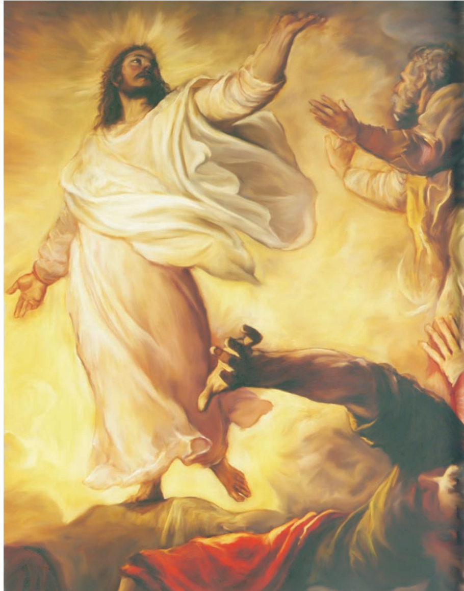
Transfiguration - Titan 1488-1576

And 3 it came to pass after about six 1,2 or eight 3 days, Jesus 1 took Peter, James, and John his brother 1 , and 2 led them up into a high 1,2 mountain apart 2 by themselves 3 to pray. 3 And as he prayed, the fashion of his countenance was altered, 1,2 and he was transfigured before them. 1 His face shone as the sun, 1,2 and his raiment 2 became shining, exceeding white as snow, so as no fuller on earth can whiten them and glistening 3 as the light 1 .