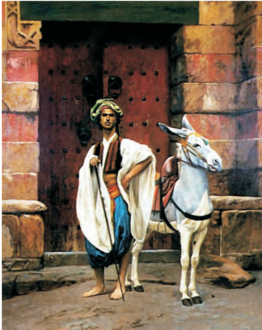
Jean-Léon Gerome 1898

"And he said to him, 'Friend, how did you come in here, not having a wedding garment?' And he was speechless. Then the king said to the servants, 'Bind him hand and foot, and take him away, and cast him into outer darkness.' There shall be weeping and gnashing of teeth. For many are called, but few are chosen." 1 Mt 22:12-14