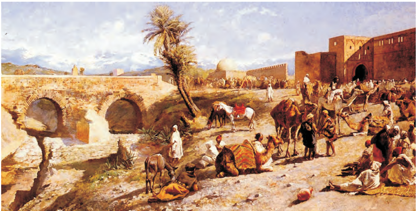
O Jerusalem, Jerusalem - Edwin Lord Weeks 1873

“ 3 Therefore also the wisdom of God said, ‘I will 3 send to you prophets and apostles 3 , and wise men, and scribes; and some of them you will kill and crucify, and some of them ye will scourge in your synagogues, and persecute 3 them from city to city: ‘That upon you may come 3 the blood of all the righteous 1 prophets which was shed ‘upon the earth 3 from the foundation of the world, may be required of this generation, from the blood of righteous Abel to the blood of Zacharias ‘son of Barachias, ‘who perished and ‘whom you slew between the altar and the temple. ‘Truly I say to you, all these things 1 shall be required of this generation.’” 1 Mt 23:29-36 3 Lk 11:45-52