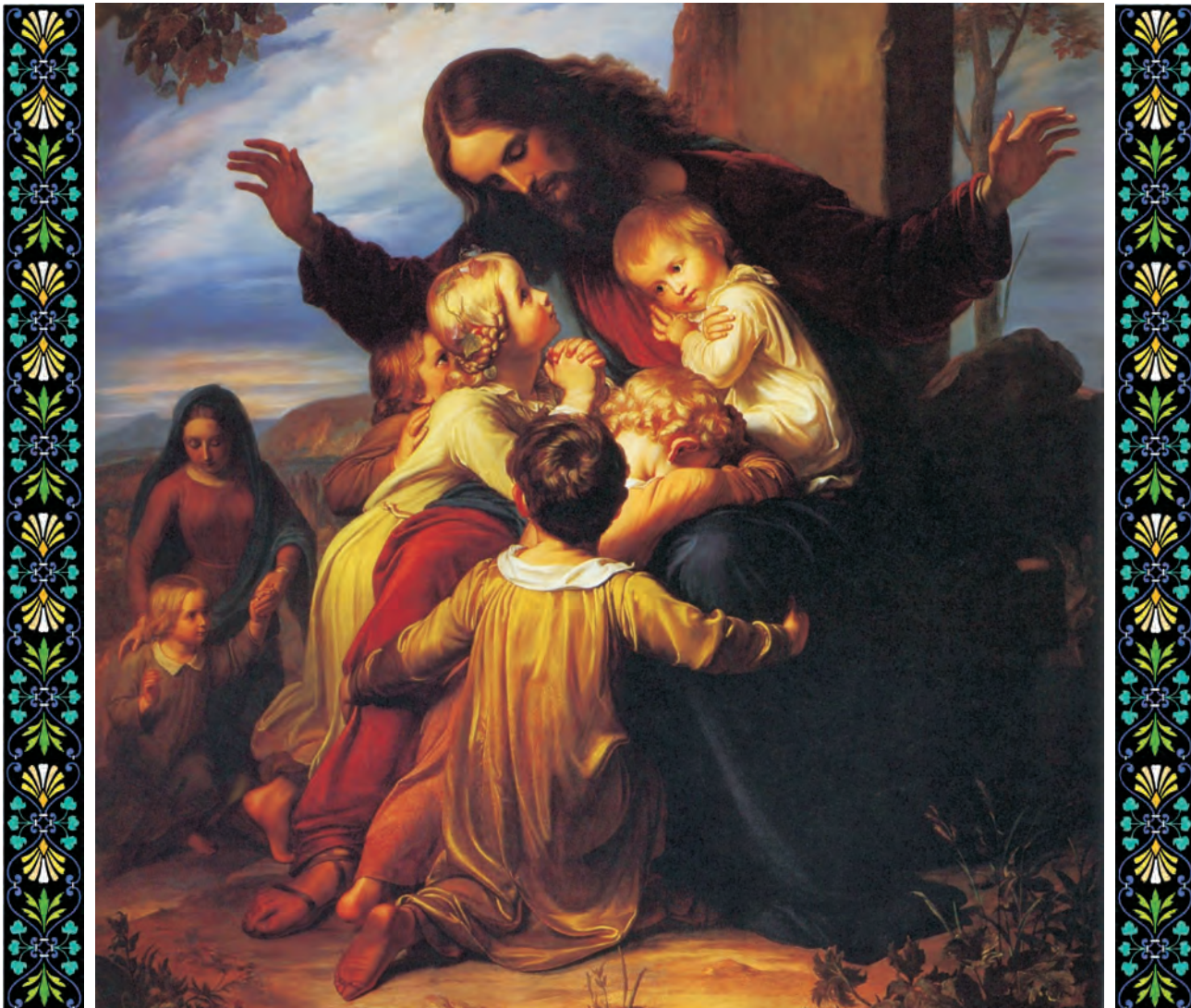
Blessing the Children - Carl Vogel von Vogelstein

2 But when Jesus saw it, he was much displeased. He 3 called them to him and said to them,