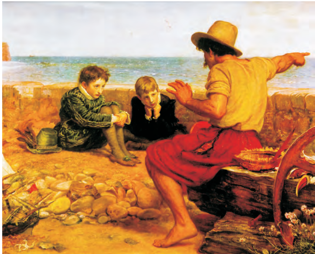
A Father and His Two Sons - John Everett Millais 1870

T hen 3 he began to speak to the people, "Hear another parable; There was a certain householder, who planted a vineyard, 2 and set a hedge around it, and dug a place for the winepress in it, and built a tower, and let it out to husbandmen, and went into a far remote 2 country 3 for a long time." 1 Mt 21:33 2 Mk 12:1 3 Lk 20:9