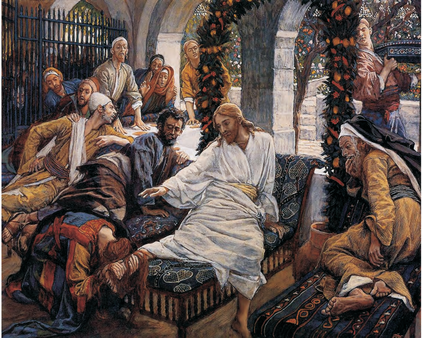
Mary at Jesus' Feet - James Jacques Joseph Tissot 1886-1894

'But when his disciples saw it, 1 one of them, Judas Iscariot, Simon's son, who should betray him, 1 had indignation, 2 and said, "Why was this waste of the ointment made? 1 And to what purpose? For it might have been sold for more than 2 three hundred pence, and given to the poor." 2 And they murmured against her. 4 He said this, not that he cared for the poor; but because he was a thief, and had the bag, and bore what was put therein. 1 1 Mt 26:8,9 2 Mk 14:5 4 Jn 12:4-6 'When Jesus understood it, he said to them,