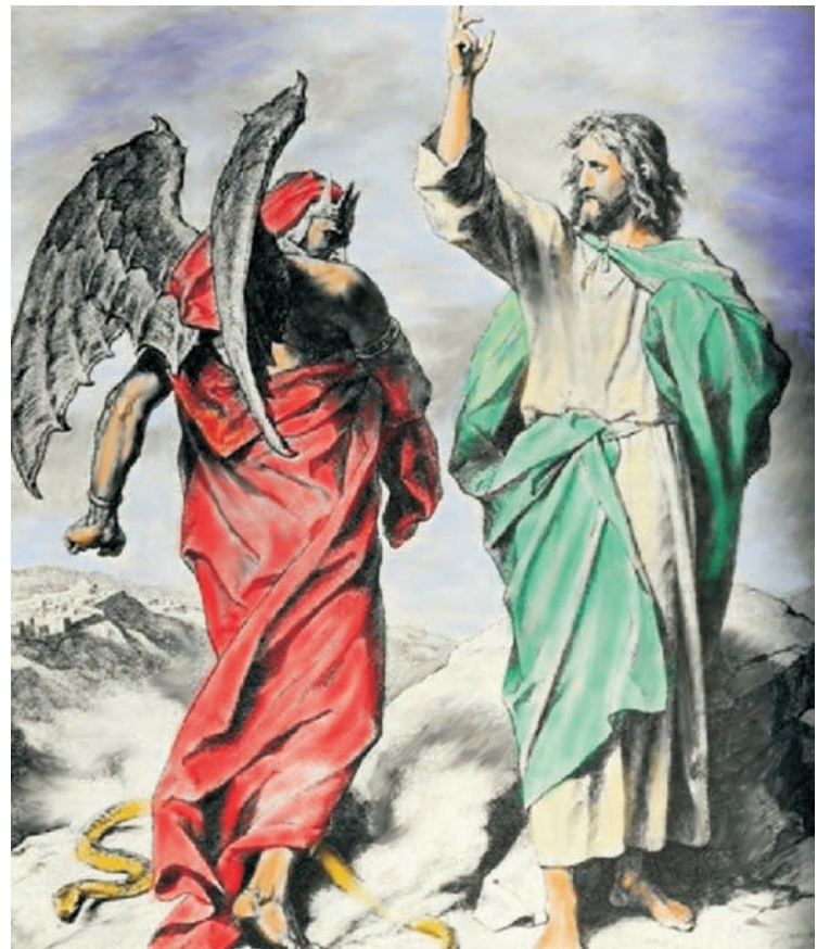
Get Thee Behind Me - Heinrich Hoffmann

Then Peter took him, and began to rebuke him, saying, "Be it far from you, Lord: this shall not be to you." But when 2 he had 2 turned and 2 looked on his disciples, he rebuked Peter, saying, " Get behind me, Satan: you are an offense to Me: for you savor not the things that are of God, but those that are of men. " 1 Mt16:22-23 2 Mk8:32-33