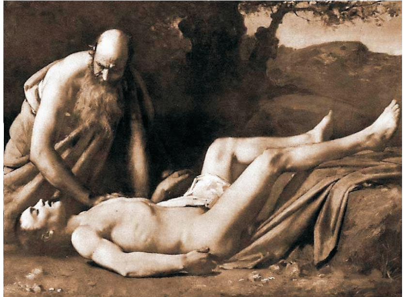
The Good Samaritan - Jean-jacques Henner c. 1870

"But a certain Samaritan, as he journeyed, came where he was: and when he saw him, he had compassion on him , and went to him , and bound up his wounds, pouring in oil and wine, and set him on his own beast, and brought him to an inn, and took care of him. And on the morrow