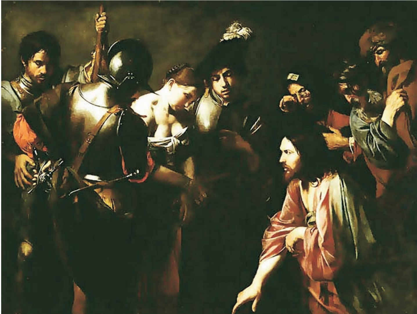
He that is Without Sin Cast the First Stone - Valentin de Boulogne 1594-1632

So when they continued asking him, he lifted himself up, and said to them, “ He that is without sin among you, let him first cast a stone at her. ” And again he stooped down, and wrote on the ground. 4 Jn 8:6-8 4 And those who heard it, being convicted by their own conscience, went out one by one, beginning at the eldest, even to the last: and Jesus was left alone, and the woman standing in the midst.