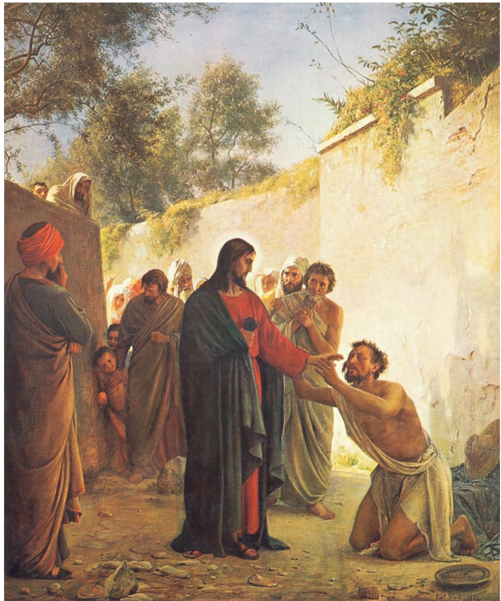
Healing the Man Born Blind - Carl Heinrich Bloch 1871

4 Therefore they said to him, "How were your eyes opened?" He answered and said, "A man that is called Jesus made clay, and anointed my eyes, and said to me, 'Go to the pool of Siloam, and wash:' and I went and washed, and I received sight." Then they said to him, "Where is he?" He said, "I do not know." They brought him that was blind beforehand to the Pharisees. Because it was the Sabbath day when Jesus made the clay, and opened his eyes. 4 Jn 9:10-14