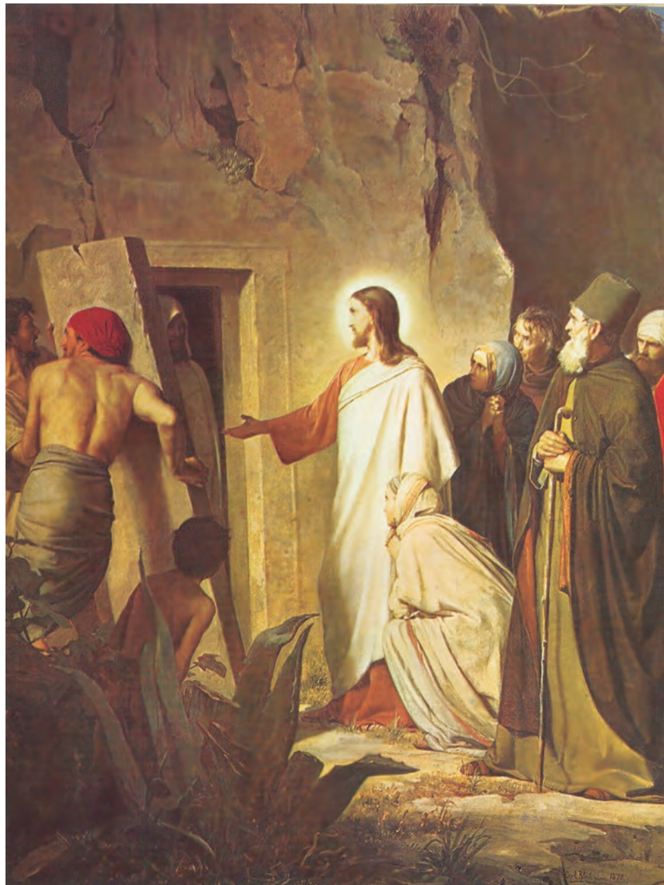
Take away the stone - Carl Heinrich Bloch