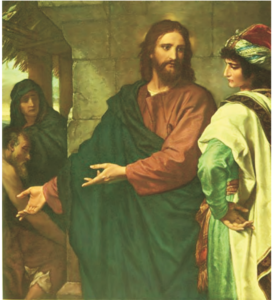
The Rich Young Ruler Heinrich Hoffmann

3 And when Jesus saw that he was very sorrowful, he 2 looked round about, and said to his disciples, " Truly I say to you, that a rich man with difficulty shall hardly 2,3 enter into the kingdom of God 2,3 in heaven. "