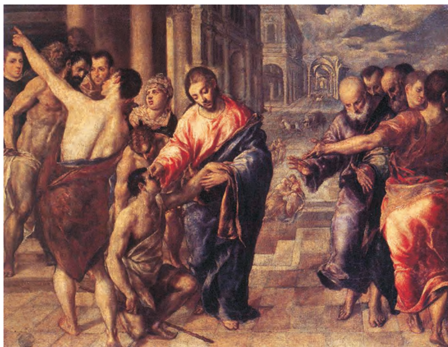
Healing the Blind - El Greco 1570