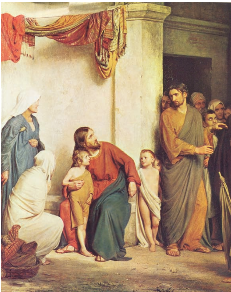
This Little Child - Carl Heinrich Bloch 1886

Except you be converted, and become as little children, you shall not enter into the kingdom of heaven.