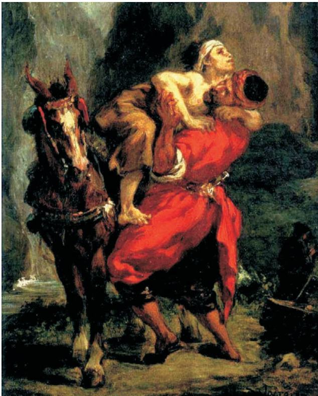
Eugene Delacroix 1798-1863

when he departed, he took out two pence, and gave them to the host, and said to him, 'Take care of him;