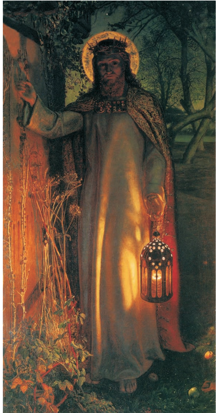
The Light of the World - William Holman Hunt 1851-1853

“And he said to them, “You are from beneath; I am from above: you are of this world; I am not of this world. Therefore I said to you, that you shall die in your sins: for if you do not believe that I am, you shall die in your sins.” Then they said to him, “Who are you?”