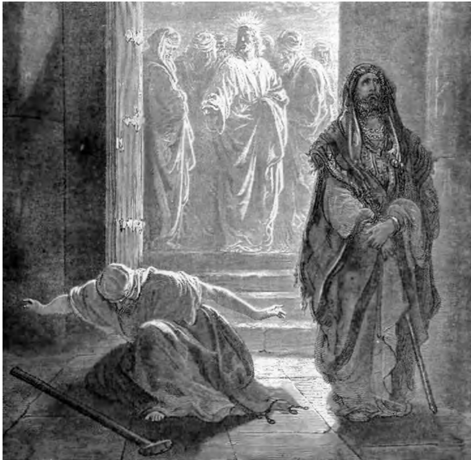
Pharisee and the Publican - Gustave Doré

The Pharisee stood and prayed thus with himself, 'God, I thank You, that I am not as other men, extortioners, unjust, adulterers, or even as this publican. I fast twice a week, I give tithes of all that I possess.' And the publican, standing afar off, would not lift up so much as his eyes to heaven, but smote his breast, saying, 'God be merciful to me a sinner.' I tell you, this man went down to his house justified rather than the other: for every one that exalts himself shall be abased; and he that humbles himself shall be exalted." 3 Lk 18:9-14