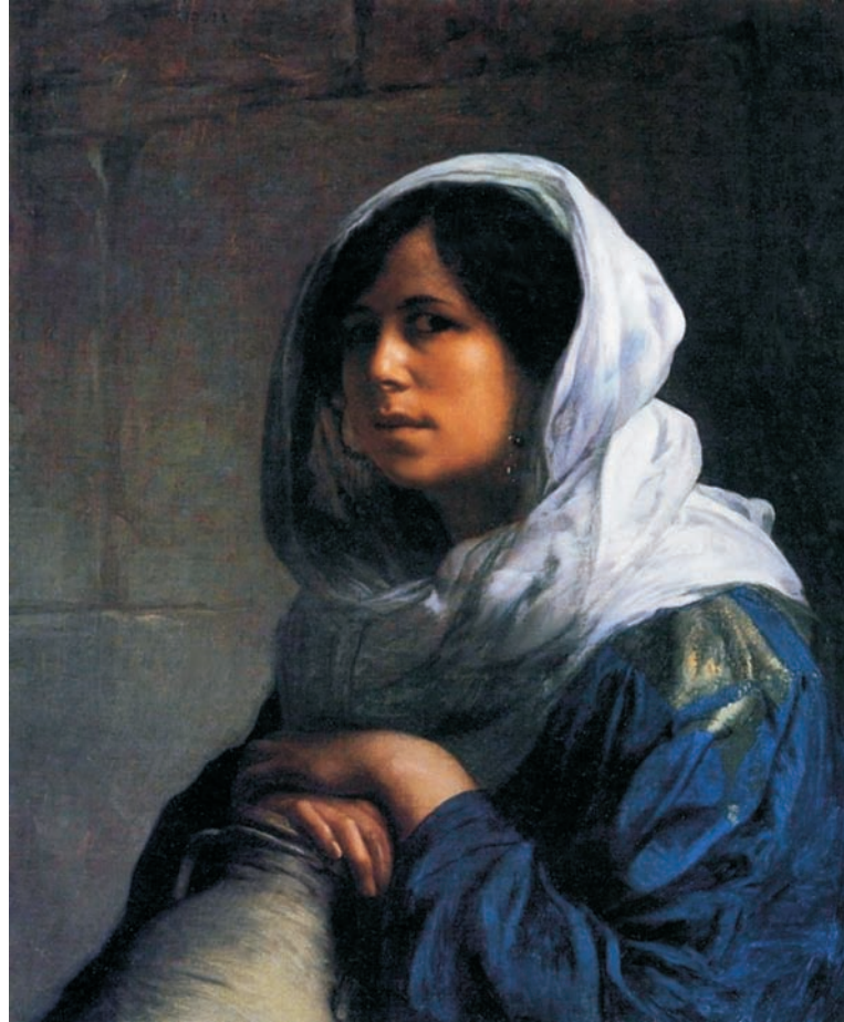
Jean Leon Gerome 1882