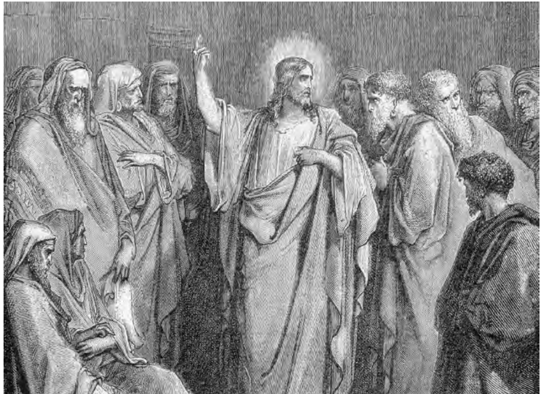
Certain of the Sadducees - Gustave Dore

“Therefore in the resurrection, when they shall rise 2 , whose wife shall she be 1 of the seven? For all seven 2,3 had her to wife 2,3 .” 1 Mt 22:28 2 Mk 12:23 3 Lk 20:33