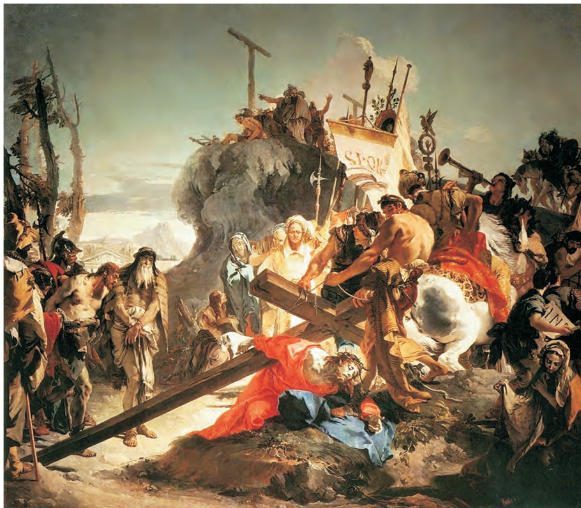
If I be Lifted Up I Will Draw All Unto Me Ho p6smmo Nsygodys Tiepolo 1737

2 For David himself said 3 in the book of Psalms, 'The LORD said to my Lord, Sit on my right hand, till I make your enemies your footstool.'